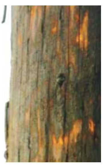
Here's a pole with its ground cut. This can be a dangerous situation for our linemen and for others during a problem with the electric system.