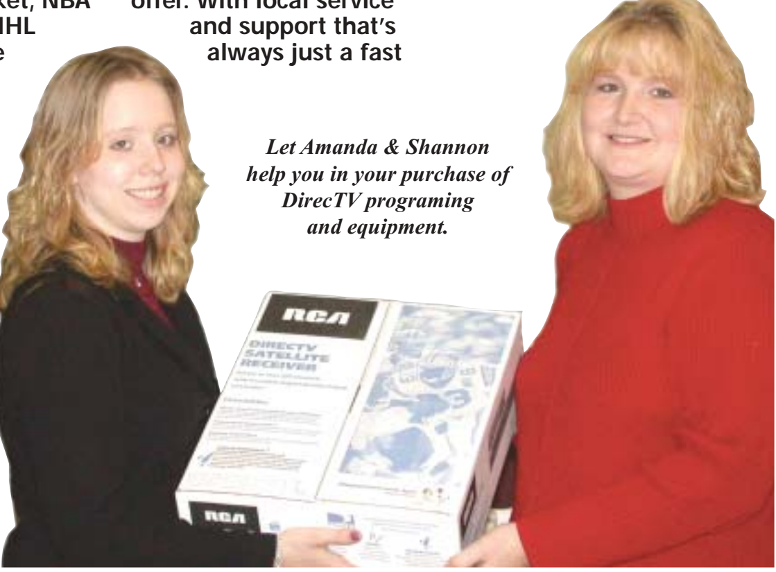
Hardware and programming sold separately. DIRECTV is a registered trademark of DIRECTV®, Inc., a unit of Hughes Electronics Corporation. All other trademarks and service marks are the property of their respective owners. ©2001 NRTC

Call today. And make a solid, hometown connection to a whole new world of entertainment.